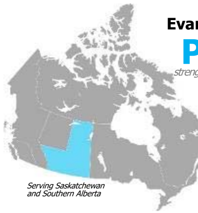
Serving Saskatchewan and Southern Alberta