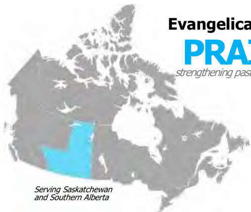
Serving Saskatchewan and Southern Alberta